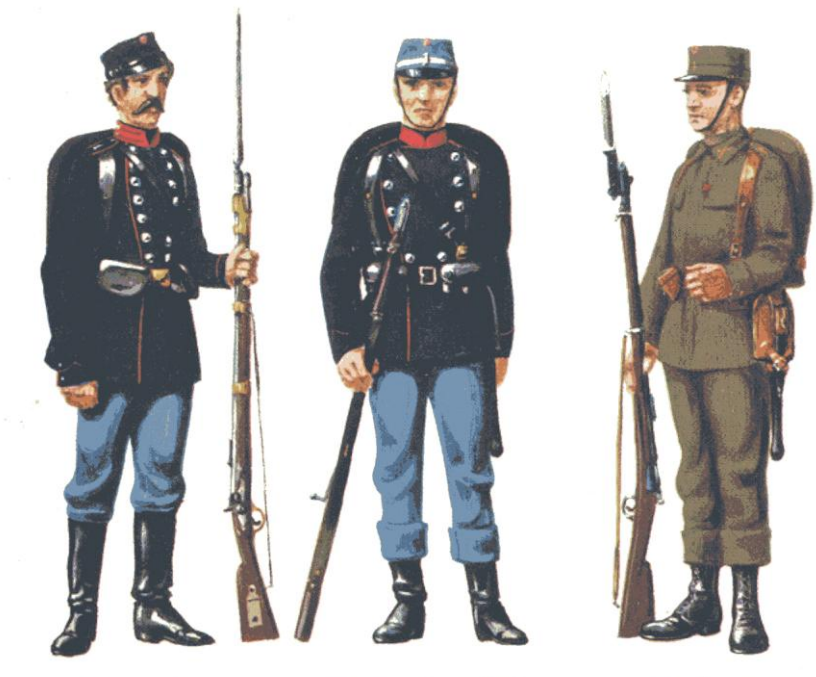
Fig. 4, 1855